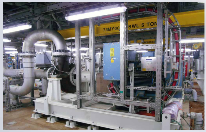
Finder cooling medium circulation pump sealed with single seal H75VN/90-E88-A1-OR, supplied in accordance with API Plan 11.