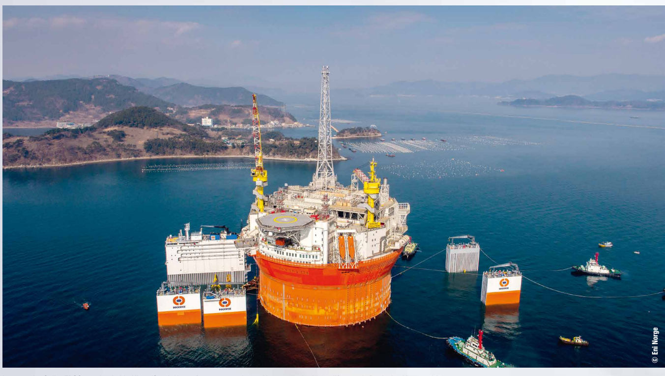
In 2015 the Goliat FPSO was loaded in Ulsan/South Korea for transportation to Norway on the heavy-lift vessel "Dockwise Vanguard."

The Goliat FPSO (Floating Production and Storage Offshore unit) is currently the most modern and largest facility of its kind worldwide. The characteristic cylindrical shape makes it ideal for the exceedingly hard wintery and icy conditions at the production location in the Barents Sea. The platform was developed by the Norwegian Sevan Marine and built by Hyundai Heavy Industry in South Korea. It is operated by Eni Norge, and Statoil Petroleum AS holds a share of 35 %.