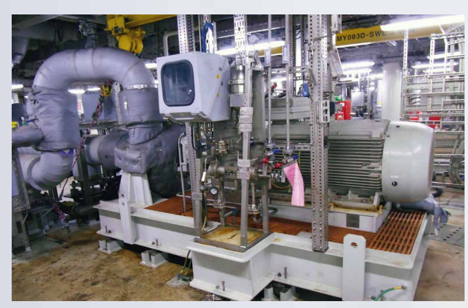
Finder circulation pump for heat carrying medium sealed with H75FD/90-E3-A1 double seals, supply in accordance with API Plan 53B.