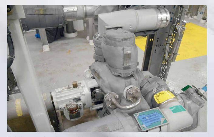
Finder hot water circulation pump. It is sealed with a single seal type H75VN/50-E87-A4-OR. Supply in accordance with API Plan 11.