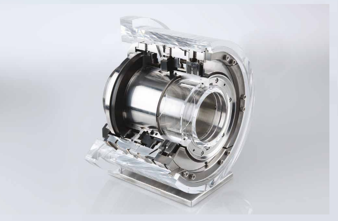
PDGS compressor seal for high pressure and low temperature applications.