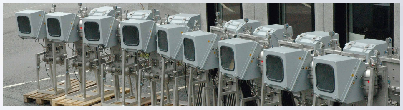
Ready for delivery: NORSOK-compliant supply units of EagleBurgmann Norway for the Goliat platform.