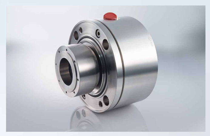
Different versions of the EagleBurgmann H75 are the predominantly installed types on the Goliat. Pictured here is a H75VK double seal.