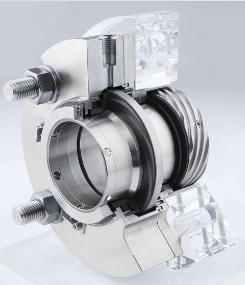
Cutaway model of an EagleBurgmann GSO-DN. The uni-directional V-grooves of the rotating counter ring and the pumping ring in the background are clearly visible.

* Technical Instructions on Air Quality Control